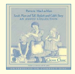
Sarah, Plain and Tall Audio CD Collection

Performed by Glenn Close All three Sarah, Plain and Tall novels collected in one deluxe CD collection. Au 0-694-52602-9